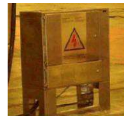
ELECTRICAL DISTRIBUTION BOARD