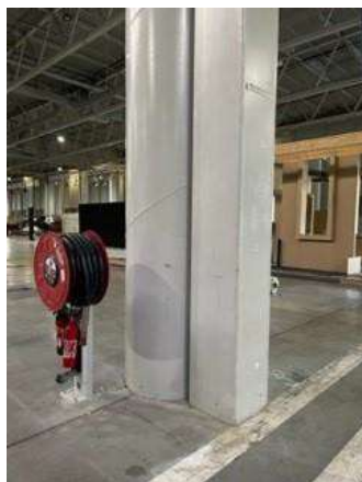
FHR: FIRE HOSE REEL